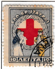
Wounded Soldier and a Family (Used Stamp)