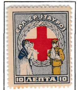
Wounded Soldier and a Family (mint)